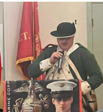
Our second Speaker, Spoke and presented exam- ples of items from The Colonial Marines