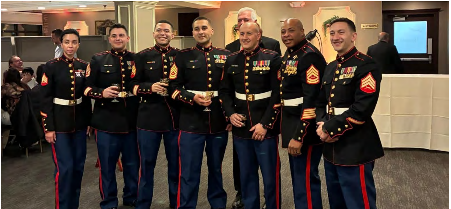
Marine Corps Recruiters from Bridgeport