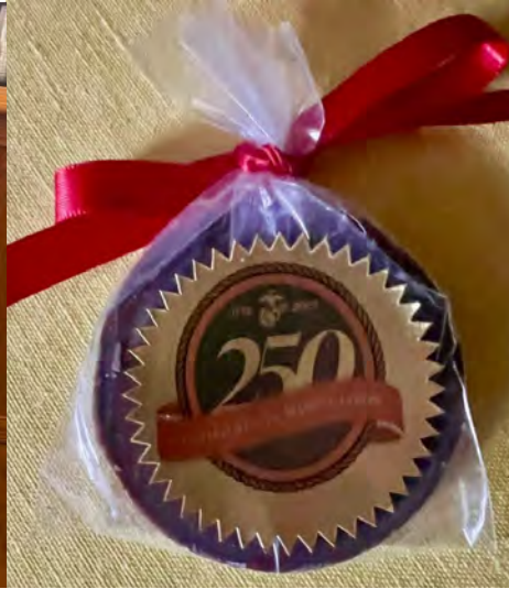
250 Years of Sweet Success