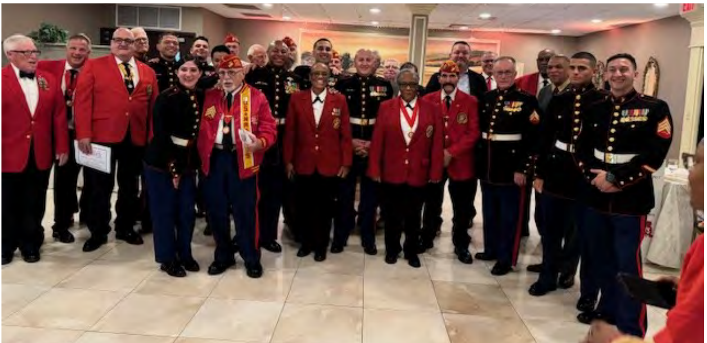
Marines from Brass City, Greater Bridgeport, and Housatonic Detachments, Marine Recruiters from Bridgeport, and Marines who just finished Boot Camp at PI at their First Birthday Celebration.