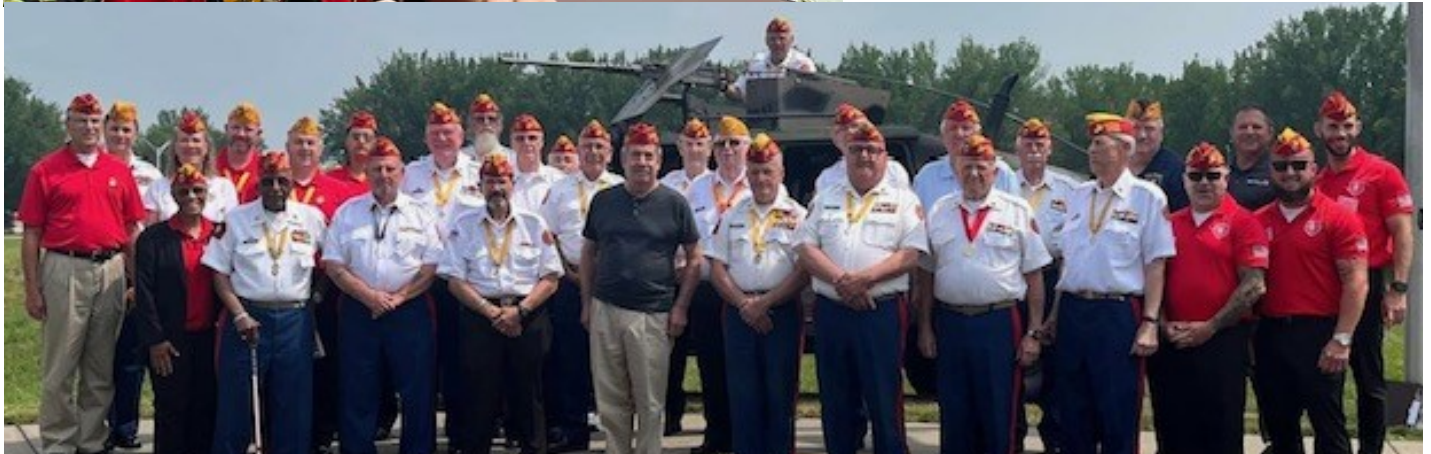
The Department of Connecticut and Honored Guests Our Commandant Has Our Back